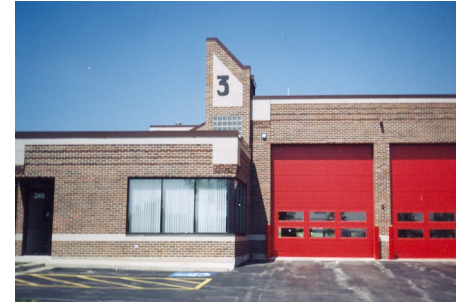
STATION 23 246 S. GARY AVENUE