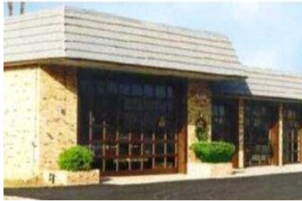
STATION 22 6N480 KEENEY ROAD