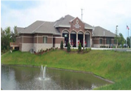
STATION 21 179 S. BLOOMINGDALE ROAD